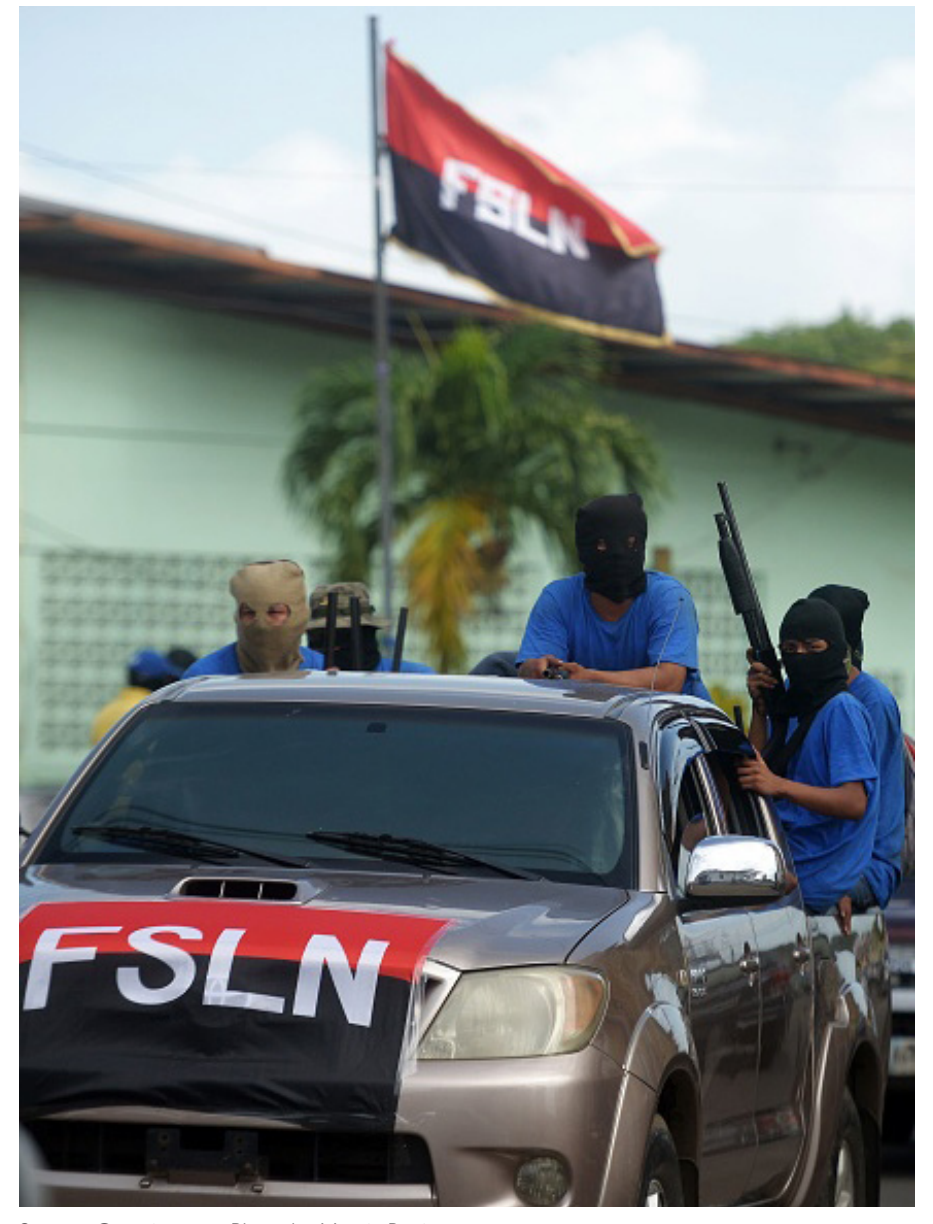
Figure 2. Heavily Armed Paramilitary Groups Terrorize Nicaragua's Streets While Bearing the Flag of the FSLN Party