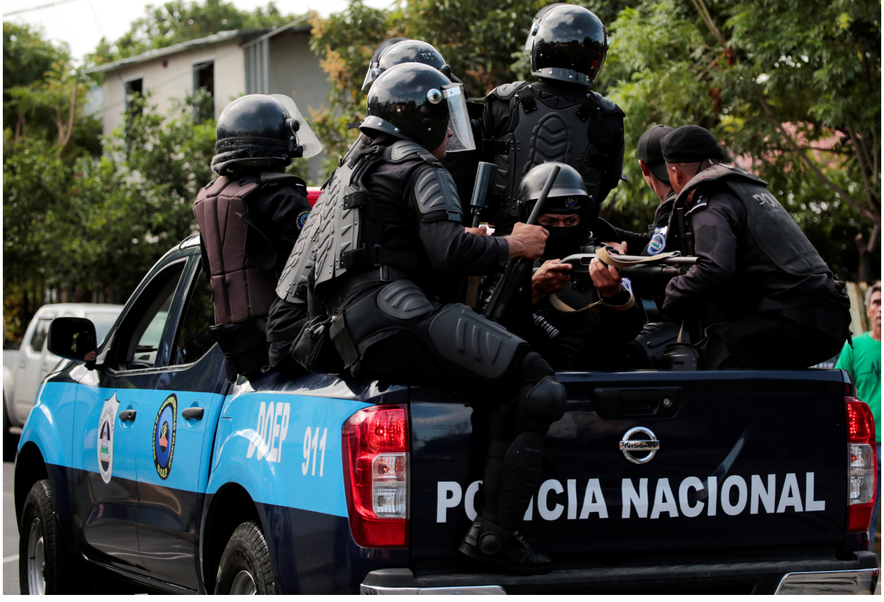
Figure 3. Riot Police Patrol the Streets During a Protest in Managua, Nicaragua