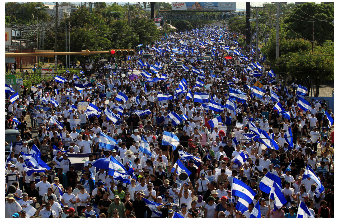
Figure 1. Peaceful Protests Calling for an End to Violence in the Capital City Managua, Nicaragua