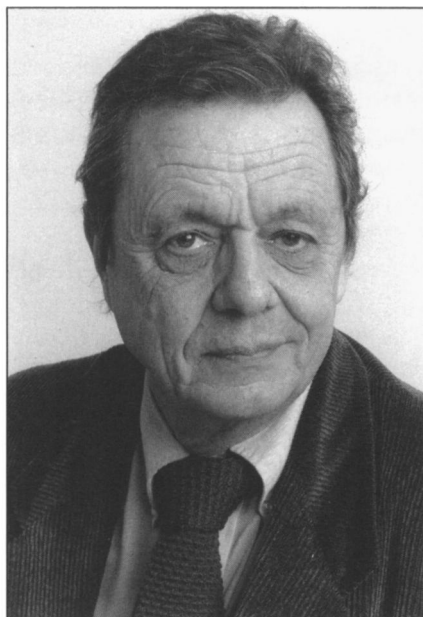
François Furet

Foner’s father and uncle imbuing him with Marxism and the mystique of class struggle. But unlike Furet, Foner saw, and continues to see, no reason why events in the Soviet Union should cause one to reconsider communism as an ideological system, or why anyone could possibly consider America a positive “role model.” In 1990, shortly after communist regimes had collapsed throughout Eastern Europe, Foner returned from teaching in Russia anxious to explain to Americans how the Russian people were being misled into thinking that life under Lenin and Stalin may not have been the best, or even the only, of all possible worlds. He also strove to explain why Russian students and scholars misunderstood American history and society: