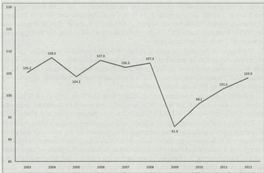
Figure 1 – Gross domestic production variation in Romania, 2003-2012 (%)