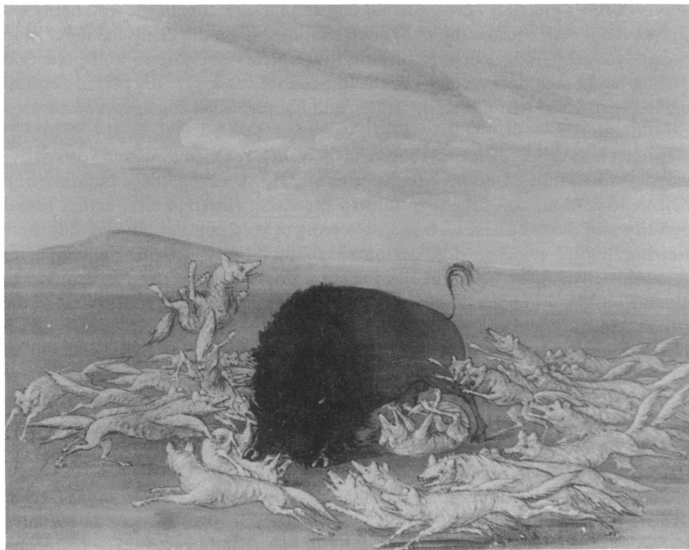
White Wolves Attacking Buffalo , watercolor by George Catlin, 1832. By preying on injured and older bison, and especially bison calves, wolves played a key role in holding bison population in equilibrium with the grasslands.

maintain an ecological equilibrium with the grasses, the Plains bison's natural mortality rate also had to approach 18 percent.