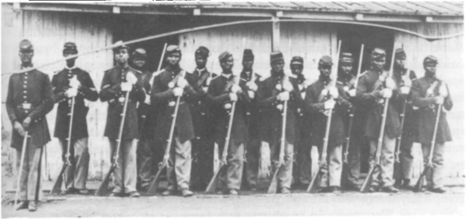
Company E, Fourth U.S. Colored Troops, at Fort Lincoln, Washington, D.C.

From the army would come many of the black political leaders of Radical Reconstruction, including at least forty-one delegates to state constitutional conventions, sixty legislators, and four congressmen. 3