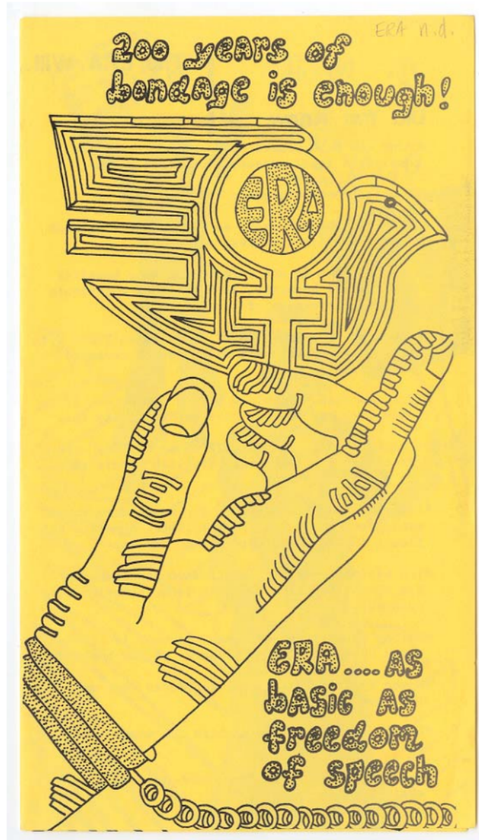
Brochure in support of the Equal Rights Amendment, 1976. Box 1, National Organization for Women, Philadelphia Chapter Records, Historical Society of Pennsylvania. http://digitallibrary.hsp.org/index.php/Detail/Object/Show/object_id/8084