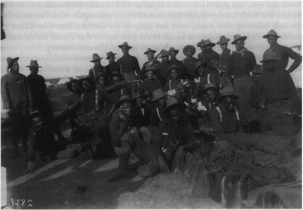
The soldiers pictured above belonged to one of the four African American United States Army regiments—the Ninth and Tenth cavalries, the Twenty-fourth and Twenty-fifth infantries—that played indispensable roles in the victories at Kettle and San Juan hills.