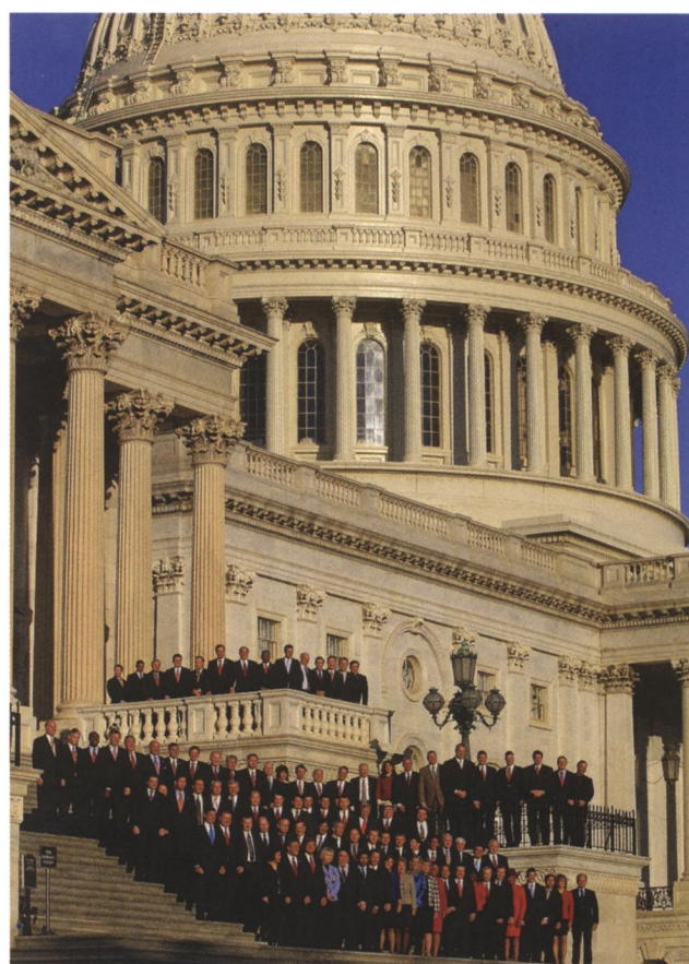
Newly elected freshmen members of the upcoming 112th Congress pose for a group photo on the steps of the U.S. Capitol on November 19, 2010, in Washington, D.C. They are due to take office in January 2011.

In practice, no system is likely to produce a cohesive, viable and supportable foreign policy. The national interest is a cluster of particular interests, and the agencies and staffs involved may have very different views as to what it should be. ■