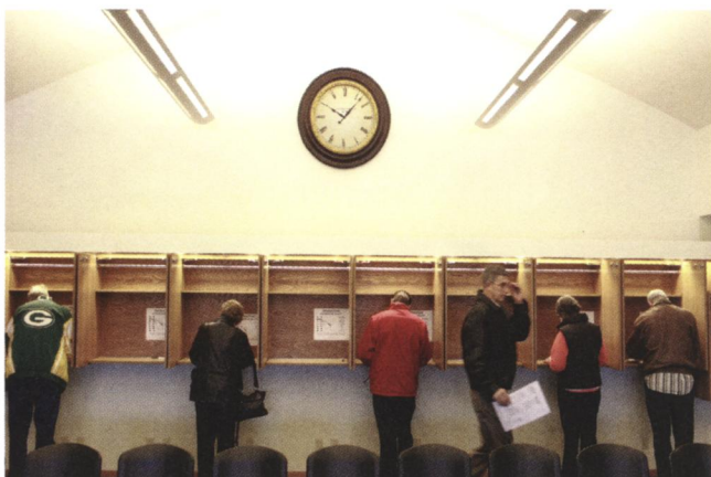
Voters cast their ballots in Westport, WI, on November 2, 2010, in elections that recalibrated the balance of power in Washington and across the nation.

the world. The public-at-large is also crisis-oriented. Its interest is aroused by vivid television coverage—for example, the events of 9/11—that demand some kind of response. Finally, the public's foreign policy outlook tends to change with some regularity—from isolationist to interventionist and back.