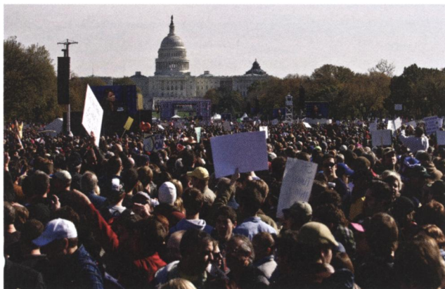
Tens of thousands of people streamed onto the National Mall in Washington, D.C. on October 30, 2010, for a rally hosted by liberal comics Jon Stewart and Stephen Colbert.

The attentive public—or elite opinion on foreign policy—represents perhaps 10%–20% of the American people. It consists of citizens who are genuinely interested and involved. They tend to be better educated and more informed. Many communicate their views to policymakers in Washington. They write letters, sign petitions, visit their representatives. The attentive public helps focus the attention and arouse the interest of the apathetic. They participate in the activities of organizations like the Foreign Policy Association, World Affairs Councils, the United Nations Association of the U.S.A., the American Association of University Women and the League of Women Voters, which have contributed significantly to raising the level of public interest in and understanding of foreign affairs. The public-opinion elite also serves as a source of new and creative ideas for policymakers and as informed critics of prevailing policy.