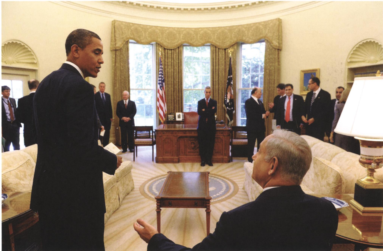
President Barack Obama forcefully told Israeli Prime Minister Benjamin Netanyahu it was time to restart the Palestinian peace process, in a meeting in the Oval Office of the White House, May 18, 2009, in Washington, D.C.

T HE CONSTITUTION has been described as an “invitation to struggle” between the President and Congress over the making of foreign policy.