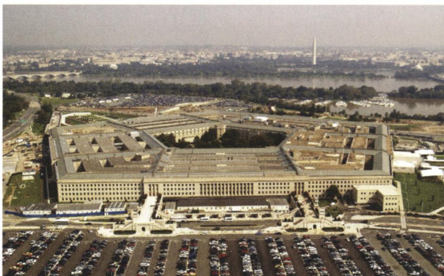
Aerial photograph of the Pentagon, September 26, 2003

Policymaking machinery tends to expand or contract,