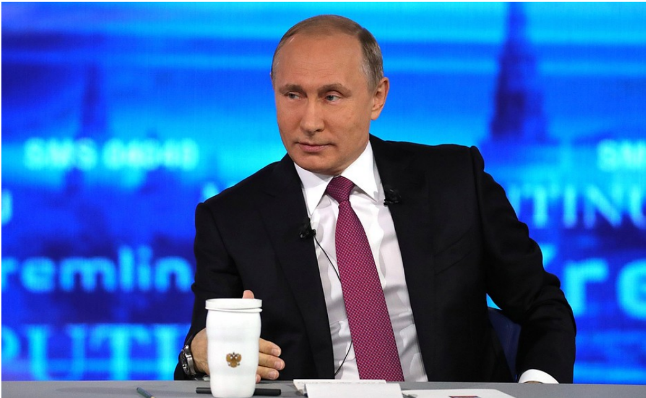
Vladimir Putin participates in the 2017 Direct Line TV programme

According to a study Russkii Reporter conducted in late 2011, Putin recruited the Russian elite from a tiny pool of candidates in the first decade of his rule. [4] The majority of these figures graduated from either of just two universities, while none of the occupants of the top 300 government positions came from Russia's far east. The most important predictor of membership of this elite circle is to have known Putin before he became president. In short, a circle of friends has governed Russia for the last 18 years. This is not a meritocratic system in any sense: most of these people did not have careers that would have prepared them for their current roles, but have simply ended up in the ruling group because of their personal loyalty to the leader. While there are no signs that the president is planning to disempower his circle of friends, he intends to open the system to increase its chances of survival. In this, the regime needs a group of professional loyalists and a system that can train and