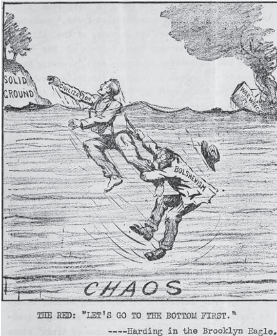
FIGURE 6.1. "Bolshevism" drags "Civilization" into "Chaos." Originally published in the Brooklyn Eagle ; republished in the Literary Digest , November 15, 1919.

of Anglo-Saxons sought to consolidate their power by creating distance between themselves and the new arrivals. 2 Their solution was a eugenic restructuring of the racial state. This change scrapped the black/white binary. They created instead a racial caste system. This system relegated immigrants from southern and eastern Europe to an inferior racial status that was viewed as not-quite-white by the Anglo-Saxons who laid claim to the state and its levers of power. This relabeling of ostensibly "white" immigrants had significant implications for the reception of foreign ideologies, namely communism, which would become so entwined and associated with the eastern and southern European "type" as to become inextricable. This association formed the explosive nucleus of domestic anticommunism and was by no means accidental. The manner by which it was constructed is the focus of this chapter.