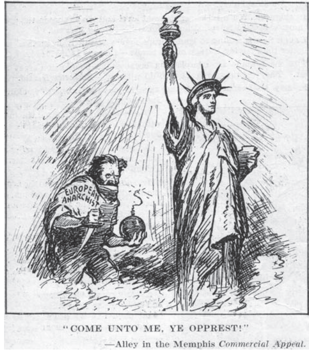
FIGURE 6.2. The “uncivilized” attack of the “European Anarchist.” Originally published in the Memphis Commercial Appeal ; republished in the Literary Digest , July 5, 1919.

of the two figures vis-à-vis one another. Paul A. Kramer reminds us that “within the Euro-American world, patterns of warfare were important markers of racial status: civilized people could be recognized in their civilized wars, savages in their guerrilla ones.” 31 The irredeemable savagery of the anarchist is clear in his unwillingness to engage Lady Liberty head-on.