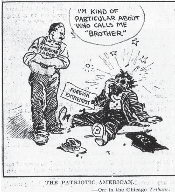
FIGURE 6.4. “American Labor” takes down the Reds. Originally published in the Chicago Tribune ; republished in the Literary Digest , June 28, 1919.

whiteness, by rejecting the “Red” outsider, often through violent means that are justified by the communists’ racial inferiority.