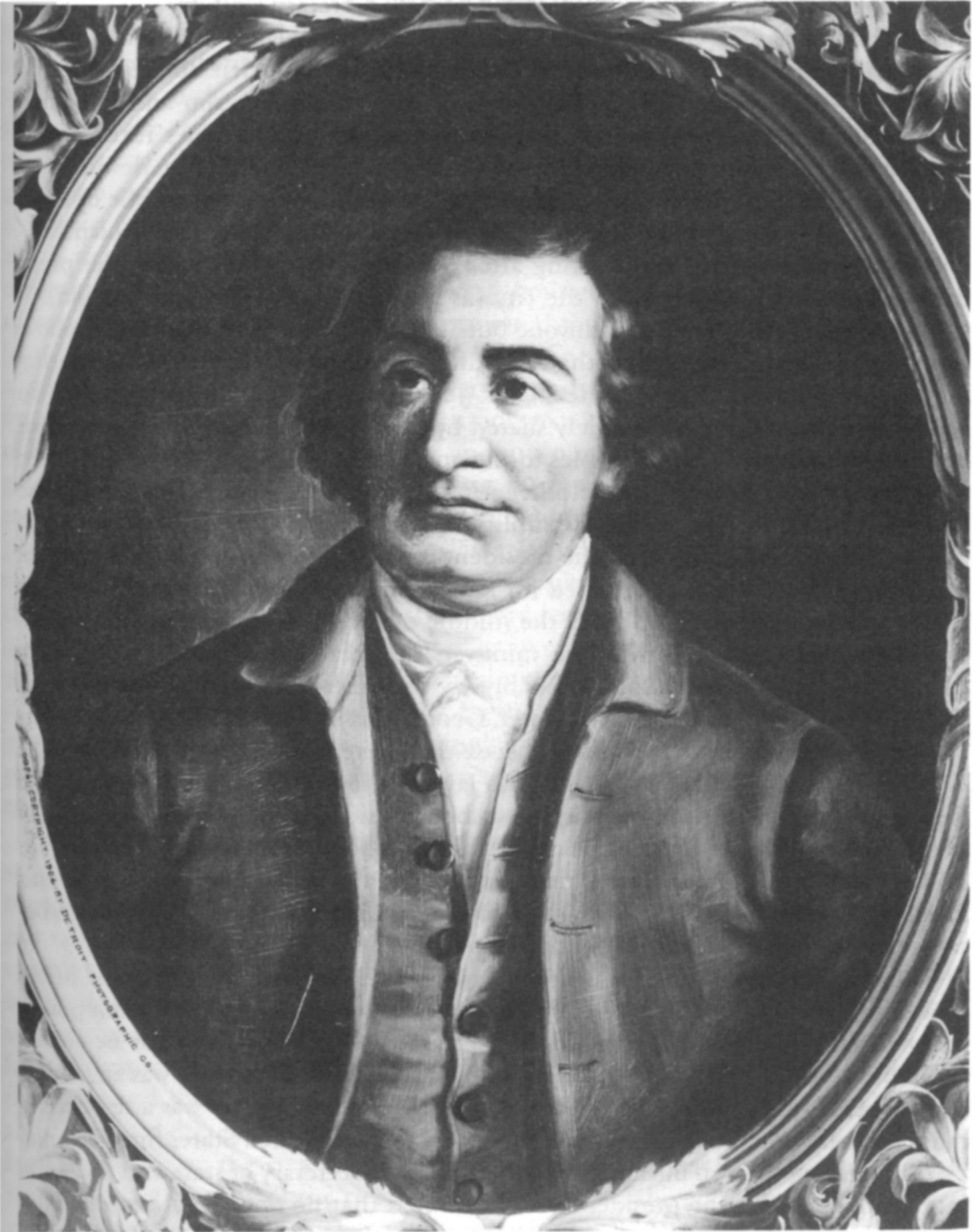
Edmund Randolph, by Constantino Brumidi. Mural in United States Capitol.