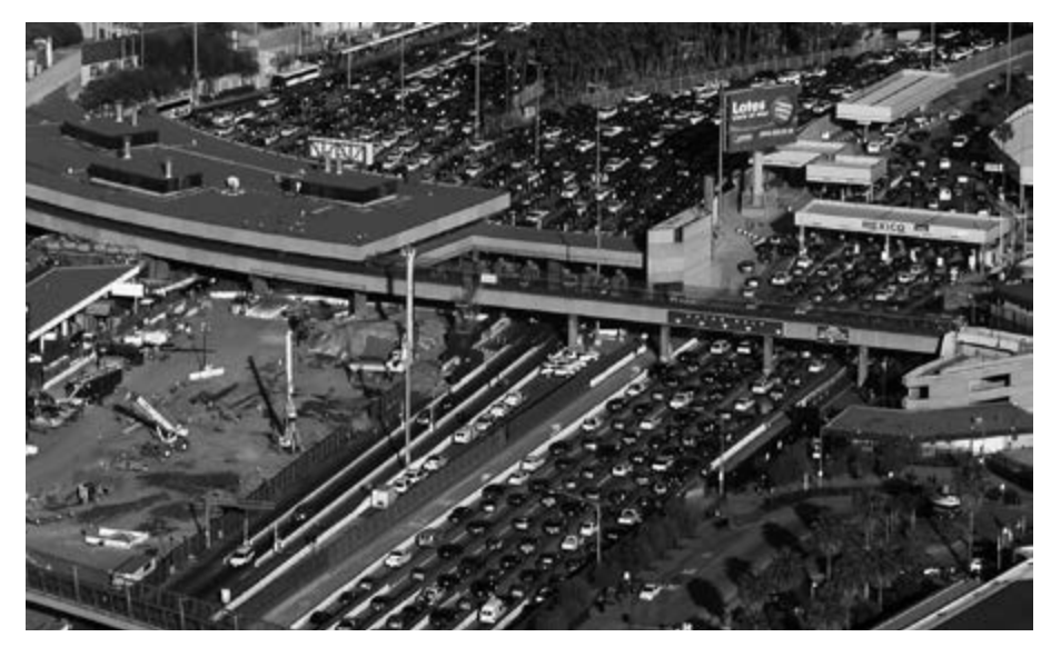
Border traffic: Several thousand people are drawn every year to enter the U.S. for diverse reasons, including commerce and tourism. The border crossing at San Ysidro between Mexico and California is one of the most frequented.

States under temporary humanitarian protection. The latter refers to the Temporary Protection Status (TPS) that was granted to citizens from El Salvador, Honduras and Nicaragua a few years ago. 15