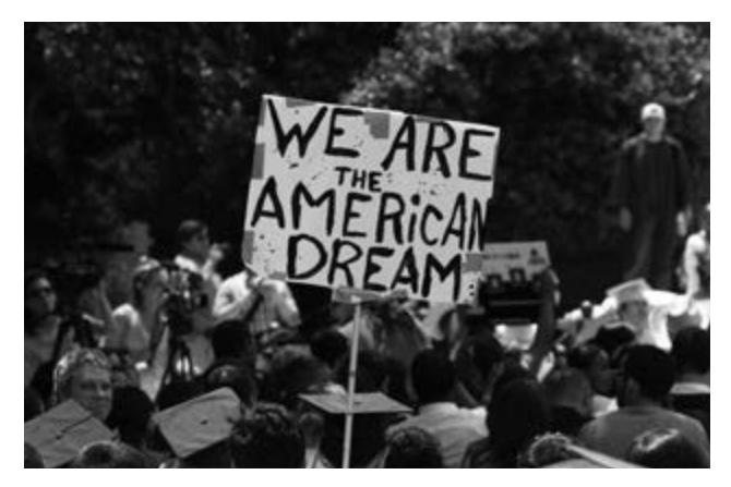
Part of the American Dream: Minors, who came to the U.S. before 2012, have the chance to attend colleges due to the "Dream Act".

more than thirty years before.<sup>21</sup> Clashes also occurred in several U.S. cities where the minors were being sent by the U.S. government, between opponents of the temporary settlement and those who expressed support.