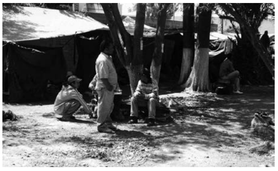
Transit migrants: Crime and unemployment drive people from Central America to leave their homes and to reach the U.S., even illegally. On their transit through Mexico emergency shelters offer help.

it is very unlikely that a Central American without much education would ever be granted a U.S. visa, and much less be allowed to legally immigrate to that country, unless they have a relative who is a U.S. citizen.<sup>25</sup>