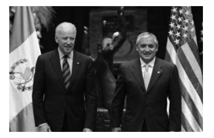
Development aid: Vice President Joe Biden, here at a meeting with Guatemalan President Otto Pérez, called for "A Plan for Central America". It aims at improving the economic development and good governance in the Northern Triangle.

In terms of citizen security the plan seeks to reinforce the programs of violence prevention and the capacity of the police force. The last pillar includes the improvement of the financial capacity of the governments and the transparency and fight against corruption. The plan is conceived as complementary to the existing development plans in each country and will be focalised in areas where there are high levels of migration.<sup>41</sup> The three governments recognise having limited resources, low tax collection capacity and limited ability to take on more debt. Therefore, they propose alternative financial mechanisms like debt-for-nature swaps, and donations based on performance indicators. At the same time, they pledge to establish better mechanisms for accountability and transparency.