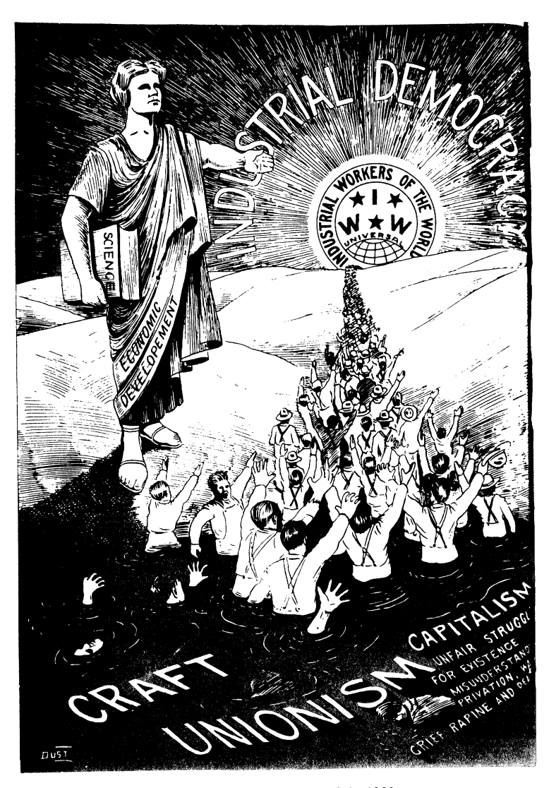
One Big Union Monthly, July 1920