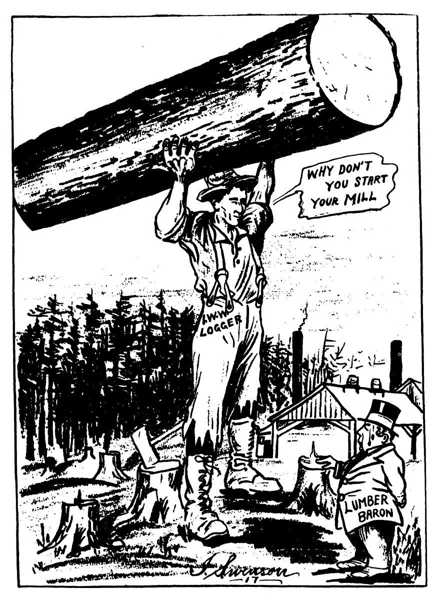
Industrial Worker, August 25, 1917