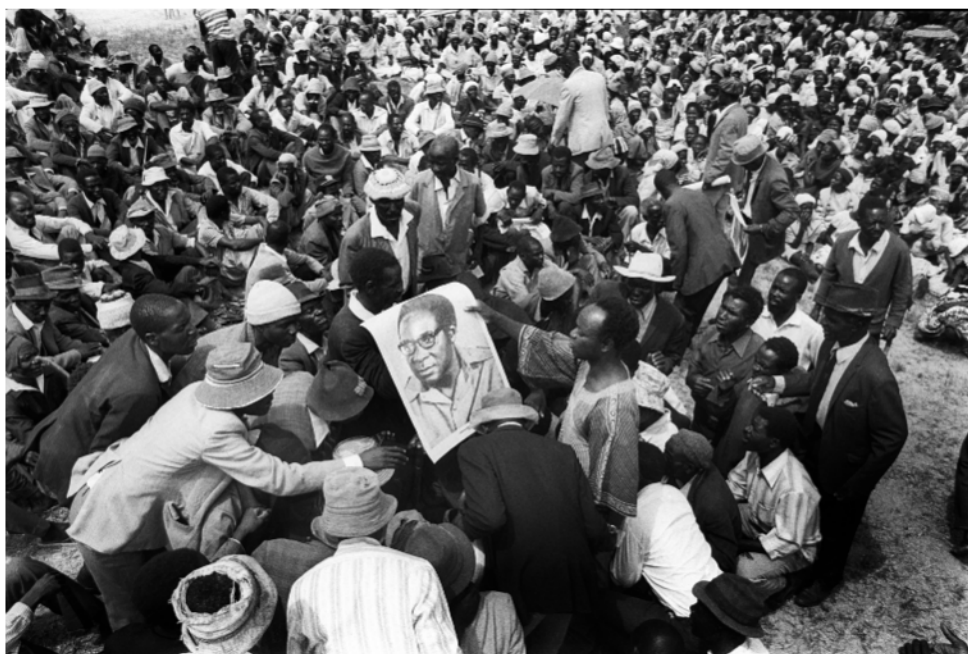
(Above) Zimbabwean Independence elections.