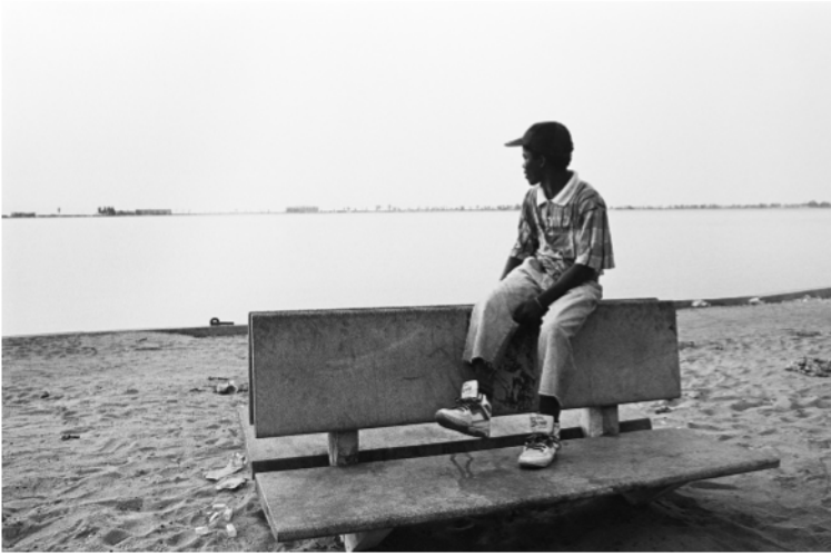
On the beach at Luanda, Angola's capital and major port.