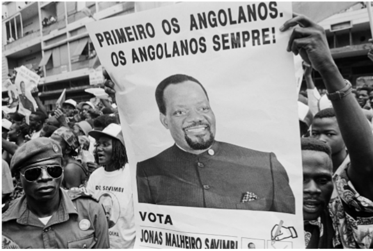
Supporters of UNITA leader Jonas Savimbi during the election campaign for Angola's first multi-party general election in 1992.