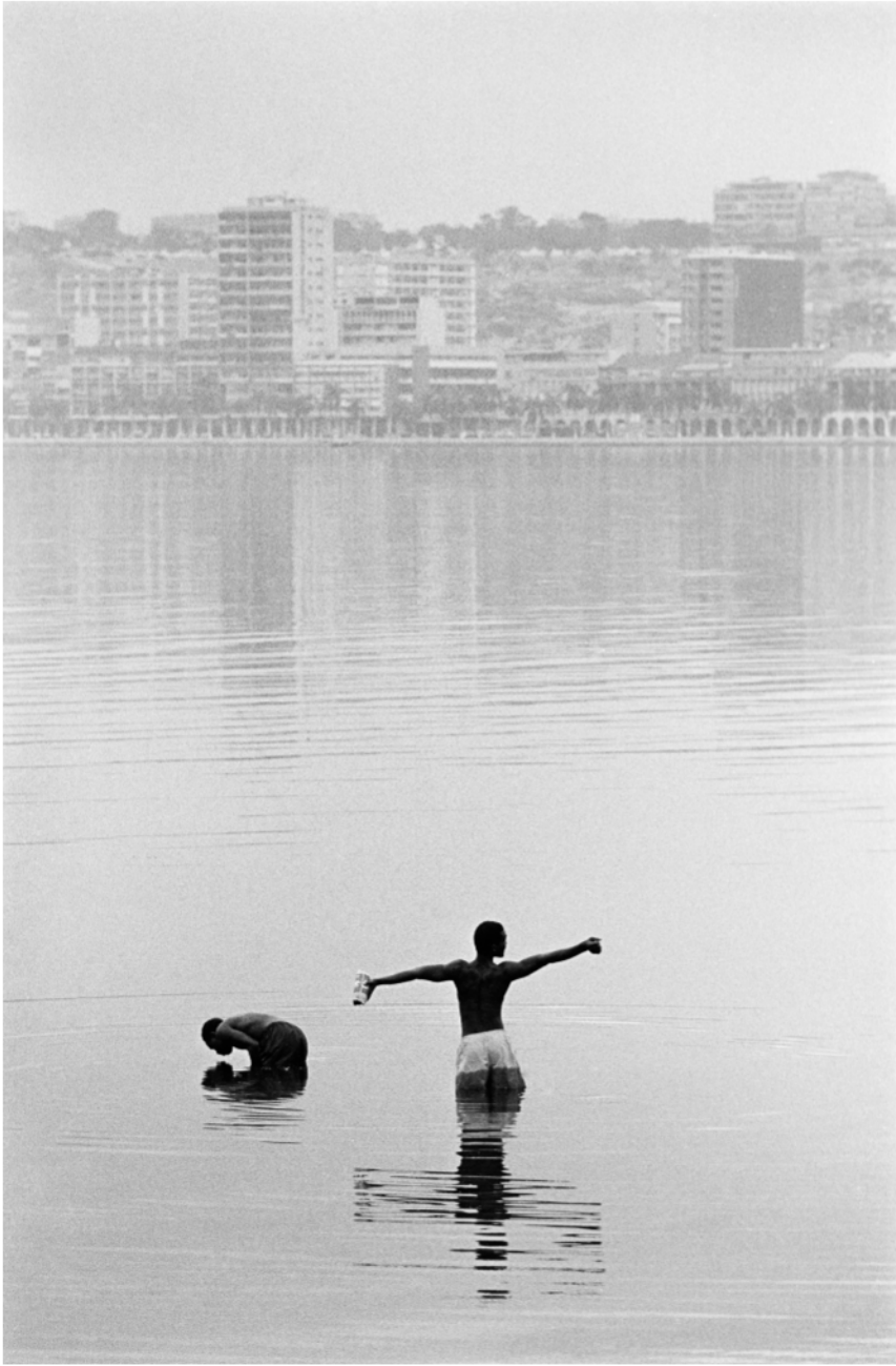
Washing clothes in front of the Luanda skyline.