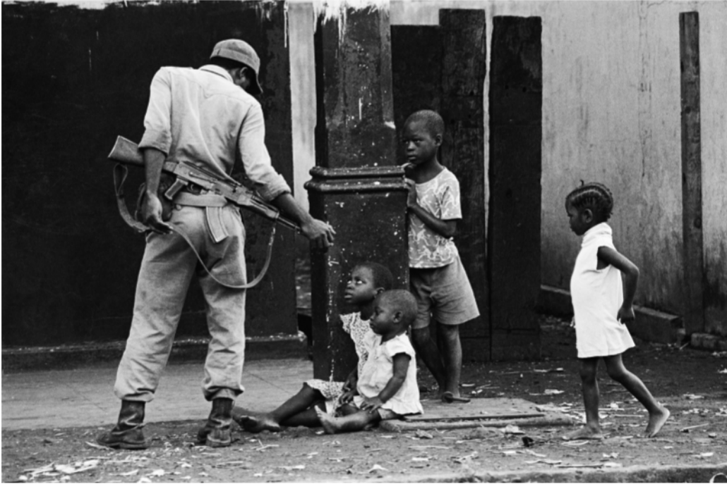
Soldier and children on a Mozambican street.