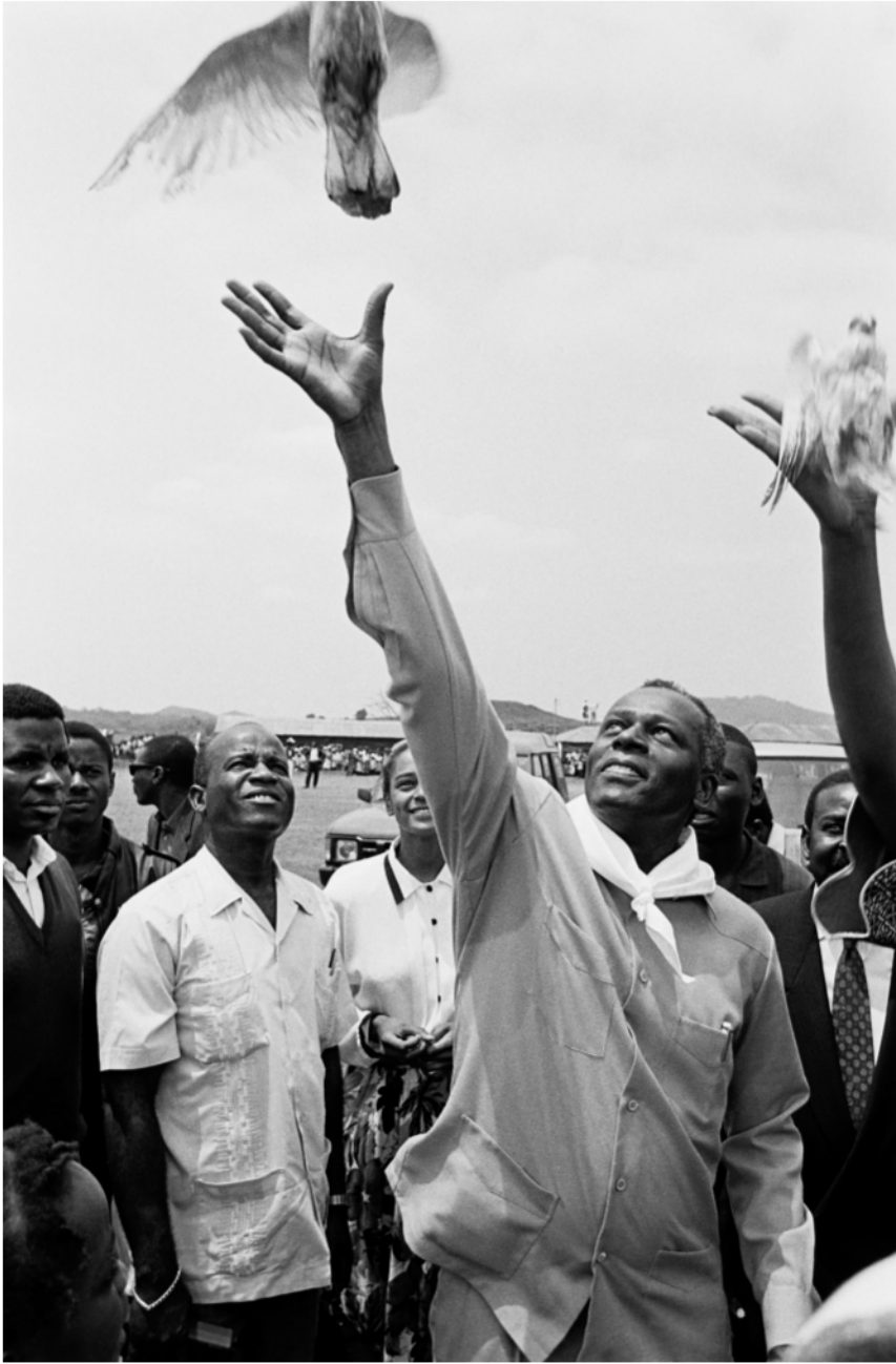
Eduardo dos Santos, MPLA leader, during the election campaign for Angola's first multi-party general election in 1992.