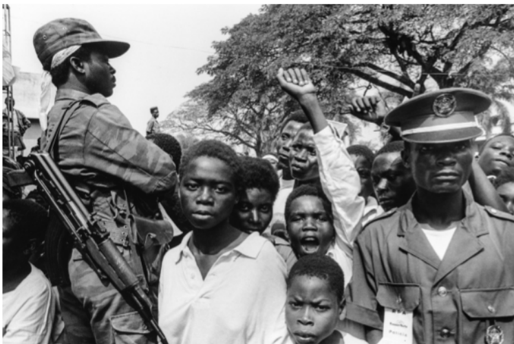
MPLA supporters, election rally. Luanda, September 1992.