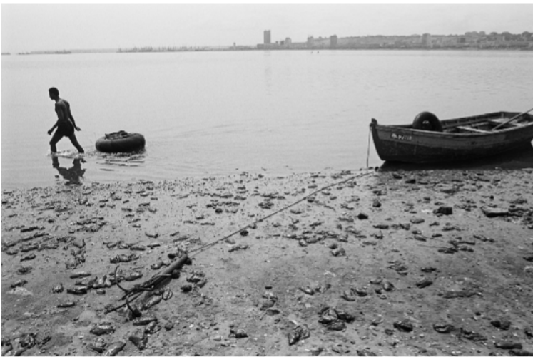
Fishermen in the port of Luanda, Angola's capital.