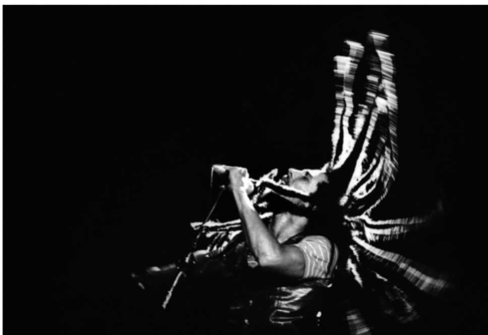
(Below) Bob Marley, Zimbabwe independence celebration concert, Harare, 1980.