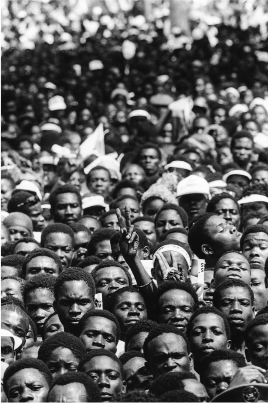
Unita supporters at pre-election rally in Luanda. Luanda, 1992.