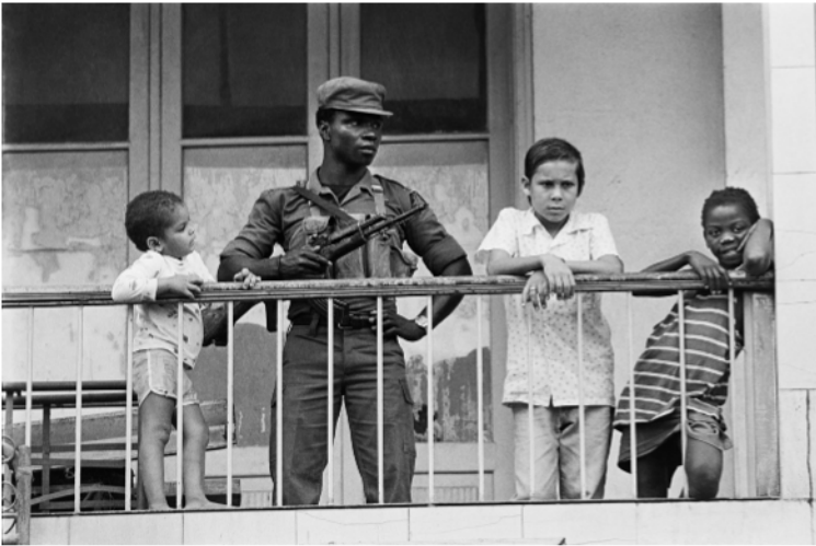
Angolan soldier with children during the country's first multi-party elections in 1992.