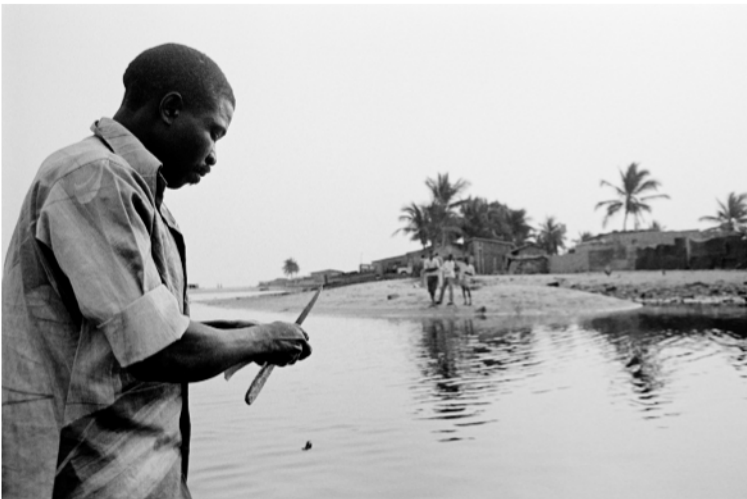
Angolan fisherman on the banks of a river.