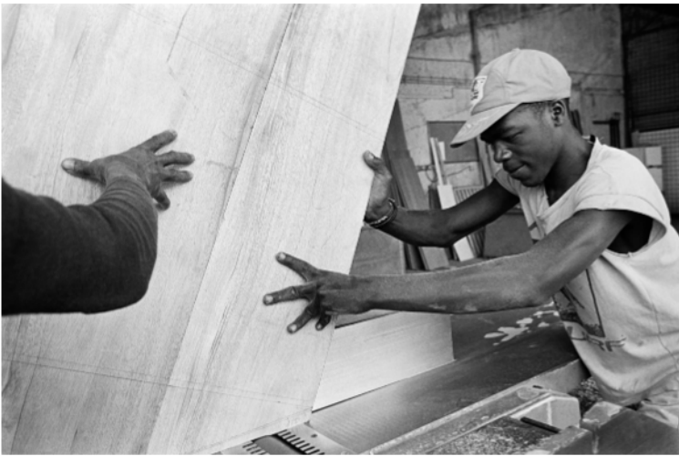
Factory workers in Angola in 1992, the year of the country's first multi-party general election.