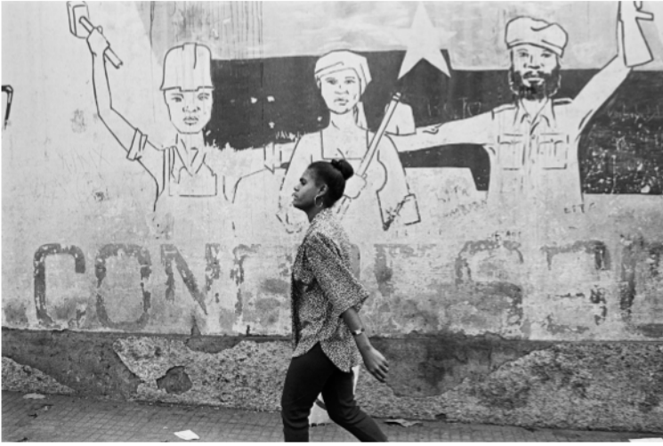
A pedestrian walks past a propaganda-painted wall during the Angola elections in 1992.