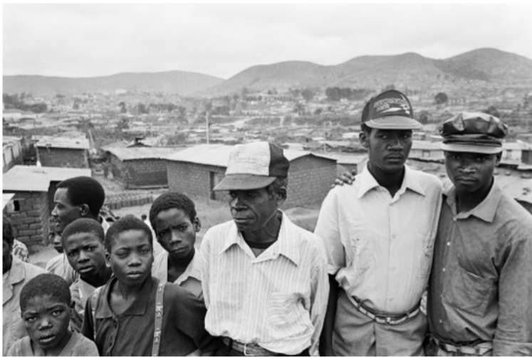
Campaigning in Angola's first multi-party general elections in 1992 after the 17-year long civil war.