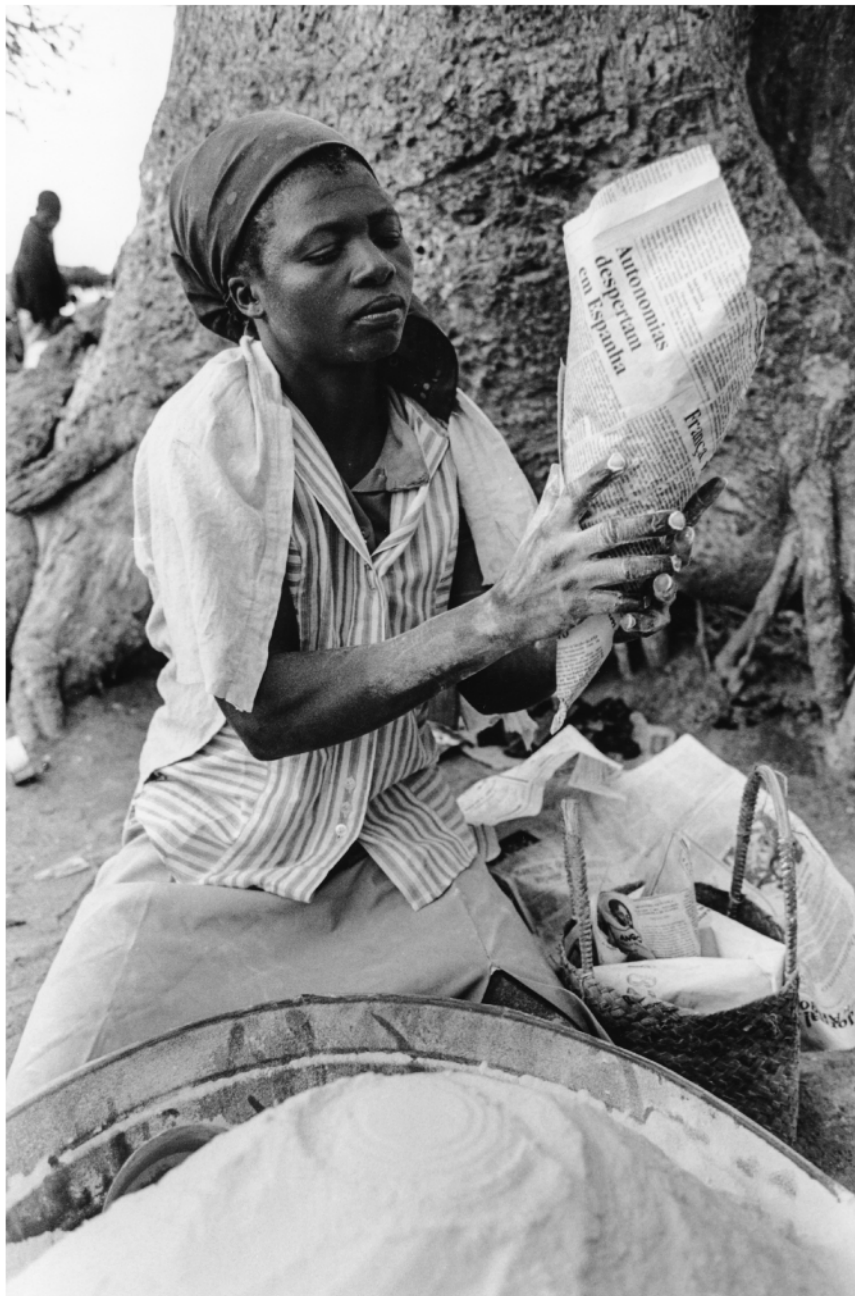
Small business makes a return. Luanda, 1992.