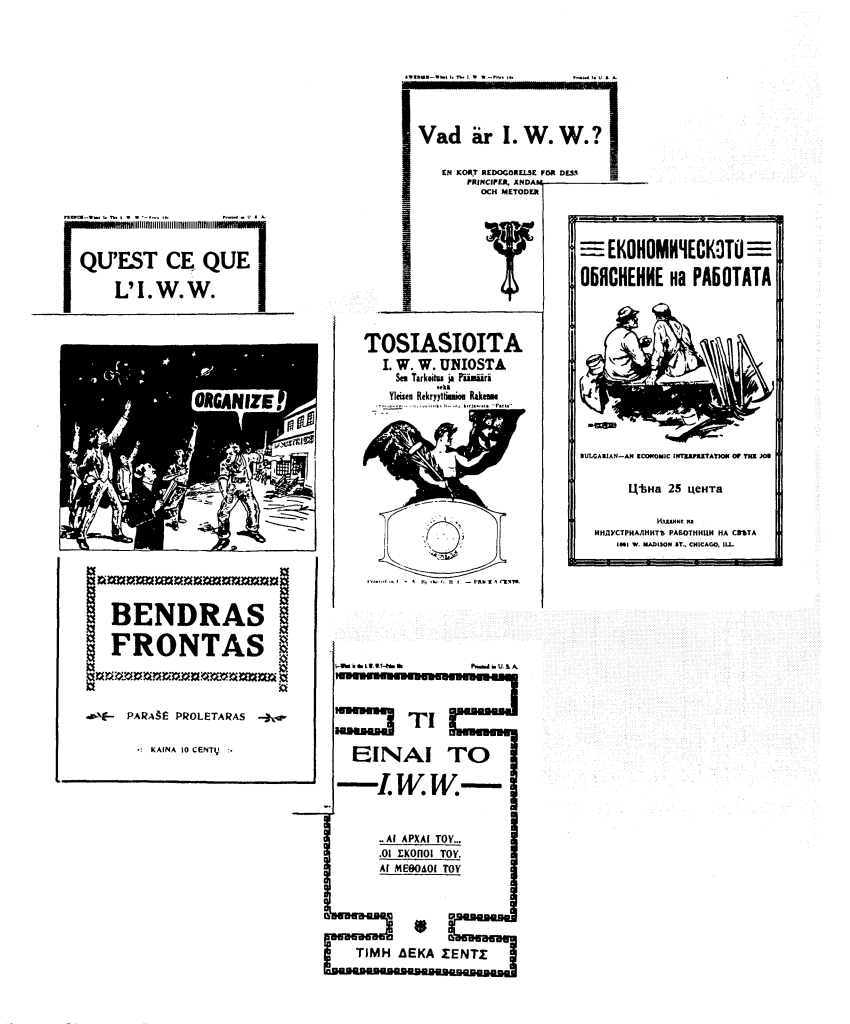
The radical Industrial Workers of the World (IWW) conveyed their own analysis of American society to immigrant workers in numerous languages.

not be resolved without looking beyond their boundaries to class-based organization.