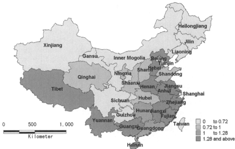
Fig. 1 Spatial distribution of comparable urbanization speed from 1995 to 2005. Chongqing was not separated from Sichuan province until 1997, when it became a Centrally Administered City

provinces—such as Fujian, Henan, Anhui, Jiangxi, and Henan—also experienced rapid growth in this period, though their urbanization rates remained relatively low. Urbanization levels in many late-developed provinces increased slowly during this period. For example, while Shanghai had a fairly slow increase in urbanization level, rising only by 6.4% from 1995 to 2005, it had the highest urbanization rate in the country, with more than 89% of the population living in the urban area. In addition, the urbanization levels in many late-developed provinces continued to rise gradually during this period, though they were still quite low. For example, the urbanization rate of Guizhou province grew from 22.68% in 1995 to 26.87% in 2005, an increase of only 19%. The empirical results discussed above show that China's urbanization process distinguishes itself as a form of uneven regional development with a huge gap in urbanization level.