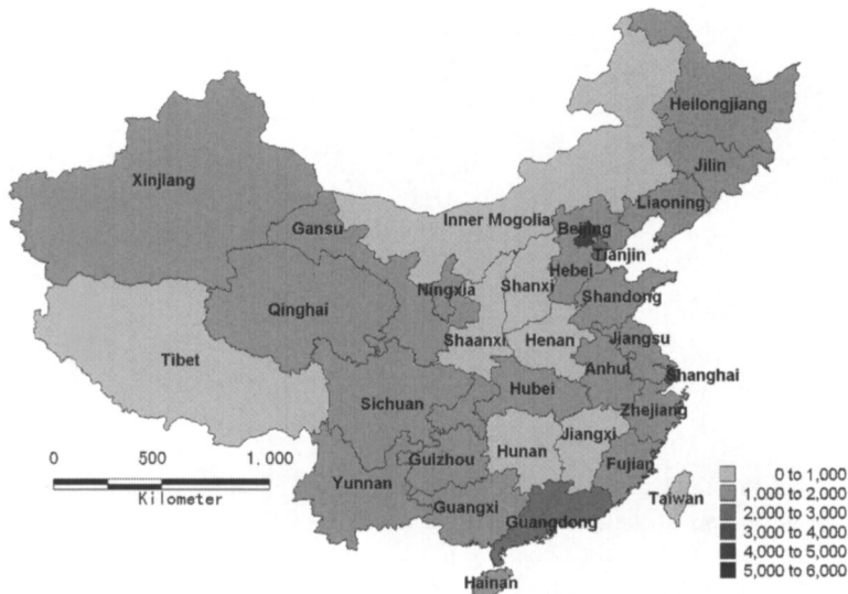
Fig. 5 Spatial distribution of commodity house price in 2005 (Yuan/sq m)

housing provision system was established in urban China was 1995. It comprised a social housing sector of ‘economical and comfortable housing’ for low- and middle-income urban local households and a commodity housing sector targeting the higher-income group (Li and Huang 2006). However, it should be mentioned that ‘economical and comfortable housing’ plays only a small part in the dual system. Moreover, the