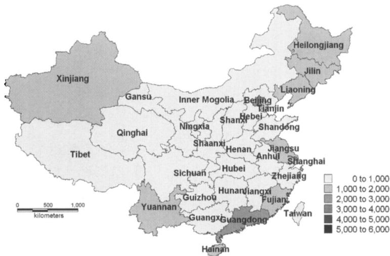
Fig. 3 Spatial distribution of commodity house price in 1995 (Yuan/sq m)

FSSCH. In light of the CPI (Consumer Price Index), Fig. 2 depicts the structure of commodity housing prices at the national level during the period from 1995 to 2005.