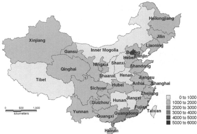
Fig. 4 Spatial distribution of commodity house price in 2000 (Yuan/sq m)