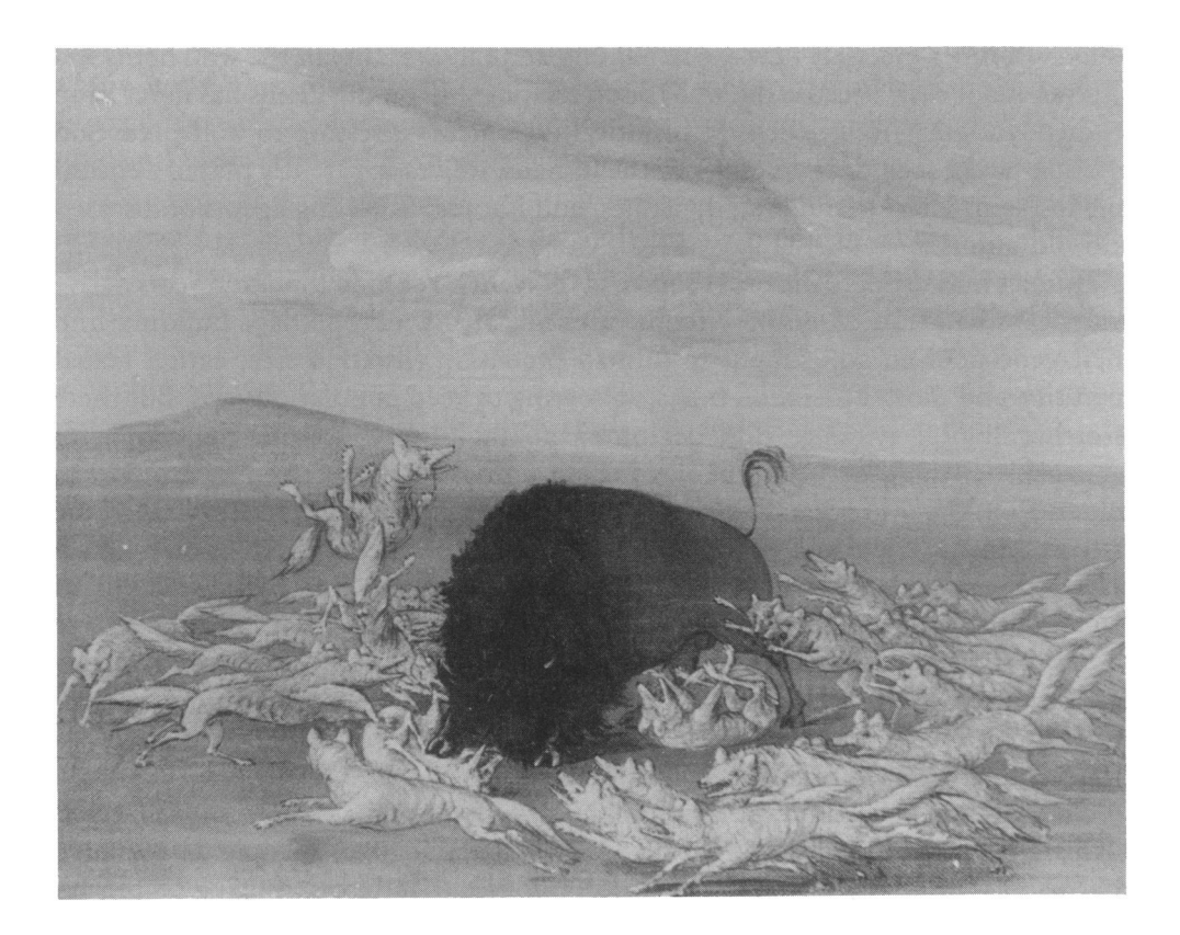
White Wolves Attacking Buffalo, watercolor by George Catlin, 1832. By preying on injured and older bison, and especially bison calves, wolves played a key role in holding bison population in equilibrium with the grasslands.

maintain an ecological equilibrium with the grasses, the Plains bison's natural mortality rate also had to approach 18 percent.