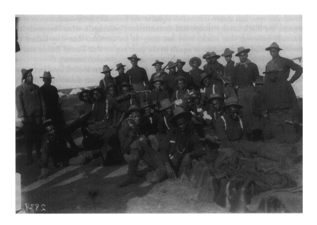
The soldiers pictured above belonged to one of the four African American United States Army regiments—the Ninth and Tenth cavalries, the Twenty-fourth and Twenty-fifth infantries—that played indispensable roles in the victories at Kettle and San Juan hills.

It is, of course, difficult to know exactly what went on at dusk, when all the soldiers, including Roosevelt himself, were exhausted from the fight and may have had difficulty seeing and thinking clearly. It is possible that some black troops may have been too quick to leave the still insecure summit for the safety of the rear when the opportunity arose. Holliday admitted that some of the Tenth Cavalry's newer recruits became nervous at being separated from the bulk of their regiment and at being in such close proximity to white soldiers. But even if nervousness prompted them to look for opportunities to leave the summit, it was not adequate reason for Roosevelt to challenge the worth of the black fighting man. There had been many instances in Cuba of white soldierly cowardice and of blacks proving themselves to be the more stalwart and reliable troops; indeed, the colored Twenty-Fourth Infantry had been called upon to charge San Juan Hill—and did—only after the white Seventy-First New York had panicked and refused to attack. Roosevelt ignored this and other incidents of white cowardice and black valor, determined as he was to charge that only black troops lacked the self-reliance and hardy individualism to become their own men, to become true Americans. In that chaotic and confusing moment on San Juan Hill, Roosevelt was certain that he had uncovered incontrovertible evidence of the black soldiers' "peculiar dependence" on white officers. Whereas the Rough Riders, in