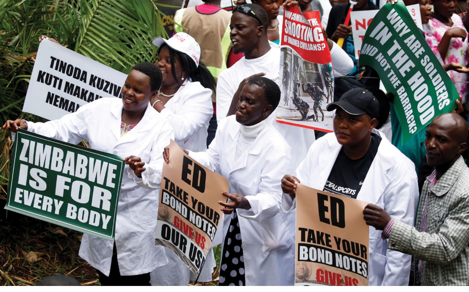
Supporters of the opposition party Movement for Democratic Change take part in a November 2018 protest against the government in Harare.

Research participants representing both local and international entities expressed concerns about the withdrawal of funding by the US Agency for International Development (USAID) from three prominent CSOs just before the 2018 elections in response to allegations of misappropriation of funds. One donor observed that "the timing could have been more strategic and the decision could have been delayed to after elections or measures could have been taken to mitigate the effects of weakening CSOs in a crucial election. . . . The decision was also opaque [in that] it did not provide any definitive information to allow the organizations to deal with the challenges internally. Because the organizations were at the forefront of civil society electoral campaigns, such as voter registration drives, the loss of funding had a crippling effect on their electoral strategy and activities. The timing of USAID's decision, and the absence of steps to ensure the CSOs could still implement a coherent electoral strategy, ended up benefiting ZANU-PF. It also fed into regime propaganda against CSOs in general.