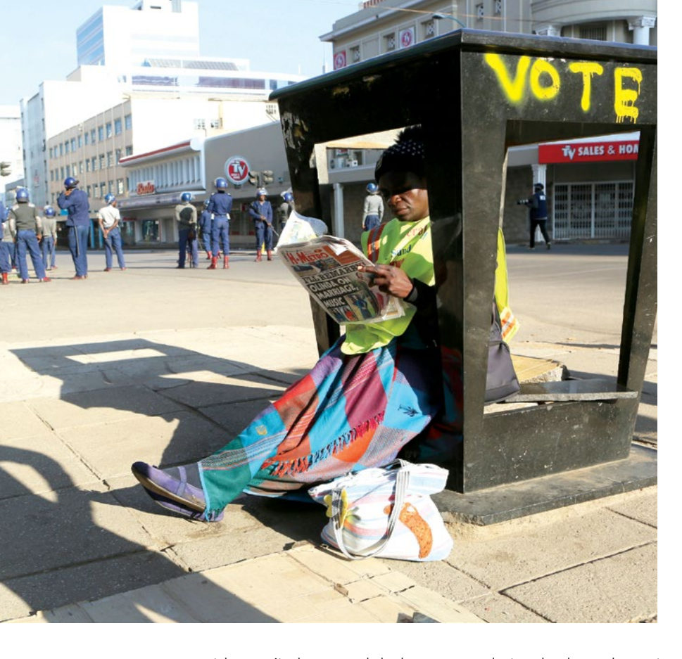
A newspaper vendor reads the news as police block a street ahead of a planned antigovernment protest in Harare in August 2019. Police patrolled the streets while many residents stayed home fearing violence.

principles and benchmarks they have laid out and agreed to follow. In Zimbabwe, where international isolation stemmed largely from human rights abuses and disputed electoral processes, the international community should ensure that these issues are addressed before writing an open check to the government. The international community should