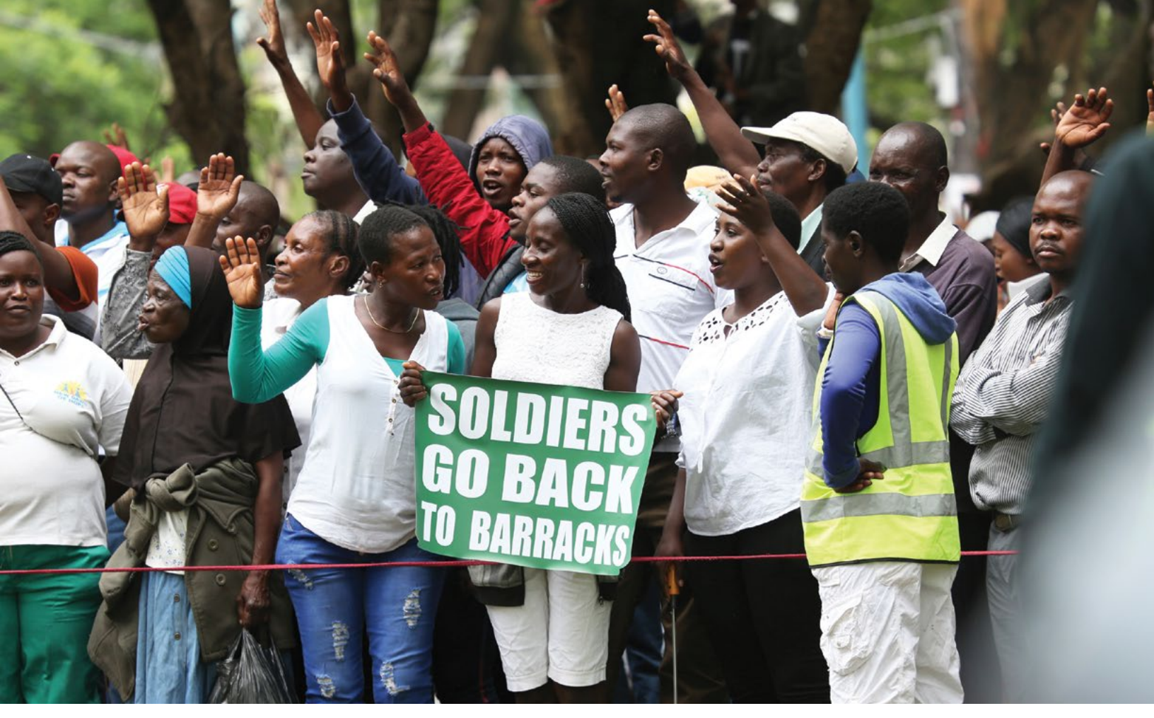
Protestors called for security forces to stand down during an anti-government demonstration in Harare in November 2018.