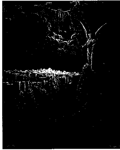
The New Jerusalem

demnation of the world system based on international trade in luxury goods, high living, ruthless exploitation of the poor, the armaments trade, injustice and bloodshed, and buying and selling "the souls of men." When this final "Babylon" is defeated, to the sound of not one trumpet, but seven, the New Jerusalem comes down from heaven onto earth and the theme of Ezekiel is picked up again as the earth is once more distributed among men in a new fellowship with God far transcending that of the garden of Eden, and the river of life flowing, not through the garden, but through the city, with the tree of life on either side of the river, with twelve kinds of fruit and leaves which are for the healing of the nations, flowing on out to bring new life to all the earth.