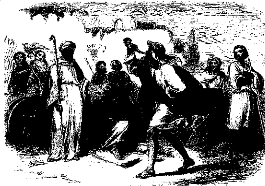
Proclaim Liberty throughout the land...

sabbatical years are referred to in Ex. 23, Lev. 25, and Deut. 15. In the sabbatical year, the land was to lie fallow, debts (including mortgages) were to be canceled, and slaves and bondservants were to be set free. When land is under mort-