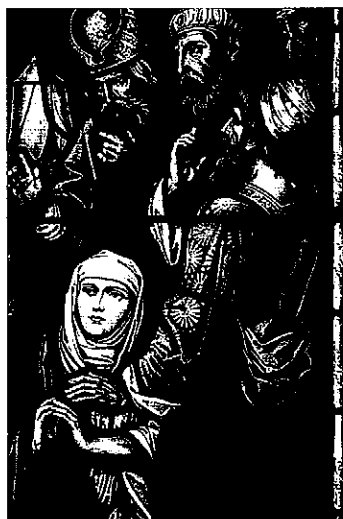
David and Isaiah

Obadiah's short prophecy is a condemnation of Edom for trying to take advantage of Judah's defeat in war and get some of her land: "On the day that strangers carried off his wealth, and foreigners entered his gate and cast lots for Jerusalem — you, too, were as one of them." (v.11) He assures Judah that the land will be restored: "The house of Jacob will possess their possessions... and those of the Negev will possess the moun-