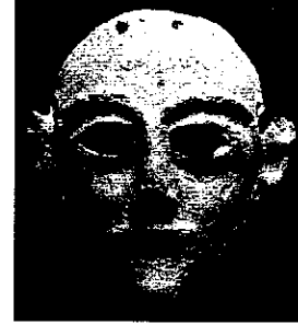
Mask of Baal, ca. 1300 BC

Elijah the prophet dealt only with Ahab and his son, Ahaziah. His successor, Elisha, headed the opposition to the Baal movement during the reigns of Ahab's second son, Joram (who succeeded Ahaziah), the reformer, Jehu, and Jehu's son Jehoahaz and grandson Joash. During the time of Elisha, one land case is recorded, but the king's name is not given. Presumably it was Jehu or one of his successors. The account is given in 2 Kg 8.6. The account is of a Shunamite woman whose son had been raised from the dead and who had been warned by Elisha of a famine and advised to leave the country. She was gone seven years, and when she returned she found that her land had been confiscated. We are not told by whom or on what pretext. It may be that the influence of the laws of Omri made it impossible for her to receive justice in the lower courts. She appealed to the king and the king, influenced by the prophet Elisha, ordered her land to be restored to her together with the revenues for the time she was away. This would indicate that she had not, as Naomi and Elimelech had done, leased her land, but had intended that it should lie fallow. The king's order that she should be given the revenue from the land indicates that this was not a case of someone refusing the right of redemption (a right unique to the laws of the Lord). Had this been a case of redemption, the revenues up to the time of redemption would have belonged to the lease-holder. The land had been seized illegally.