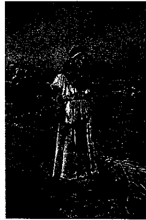
Ruth gleaning in the field of Boaz

generations before the time of Samuel. Here a land inheritance plays a key role in the romance. Apparently, before Elimelech left Bethlehem for Moab, he sold (leased) his famine-stricken acres for whatever he could get. Ten years later his wife Naomi returns to Bethlehem with her daughter-in-law Ruth, but husband and sons are dead. If she lives long enough, Naomi will get the land back in the jubilee — or, if she dies and Ruth has married within the tribe of Judah, Ruth's heirs will be able to claim it. The only right Naomi can exercise prior to the jubilee is the right of redemption. Since, due to her extreme poverty, she cannot redeem the land, she offers to "sell" it (that is, to transfer the lease) to the next-of-kin, who has the right of redemption. But she makes a condition: she will not give this right of redemption to the next-of-kin unless he is also willing to act as the brother of the deceased and marry the widow to raise up progeny for him. Thus the land will revert, in the jubilee, to the eldest son of Ruth and her husband, who will be counted as the grandson of Elimelech. The conditions Naomi lays down are unacceptable to the next-of-kin and he transfers his right to Boaz, who is next in line and cheerfully ready to redeem the property and marry Ruth. The entire affair is premised on the legal code of Leviticus.