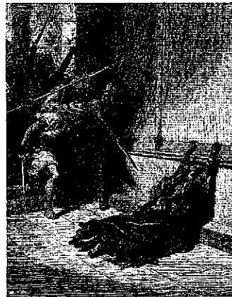
The death of Athaliah

Athaliah was determined that Jehu's reform not spread to Judah, and she had the entire royal family, including her own children, liquidated, except for Ahaziah's infant son who was rescued by Ahaziah's sister, Josheba, Jehoida's wife. Athaliah was not aware that one infant remained, secreted in the Temple. His name was Joash. For eight years, Athaliah ruled the country, but when Joash was eight years old, Jehoida the priest very skillfully and carefully arranged a coup d'etat and proclaimed Joash king before the people. He crowned him, anointed him, and "imposed the law on him" (Cf. Deut. 17:18: the king is required to write out a copy of the Law of the Lord in his own hand). The people had acclaimed the king before Athaliah knew what had happened and she was put to death when she attempted to interfere. Jehoida "made a covenant between the king and all the people, by which they undertook to be the people of the Lord. All the people then went to the temple of Baal and demolished it... and killed Mattan, priest of Baal... then taking the commanders